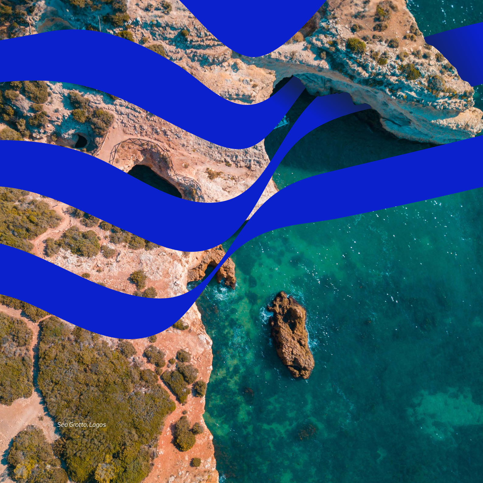
Sea Grotto, Lagos