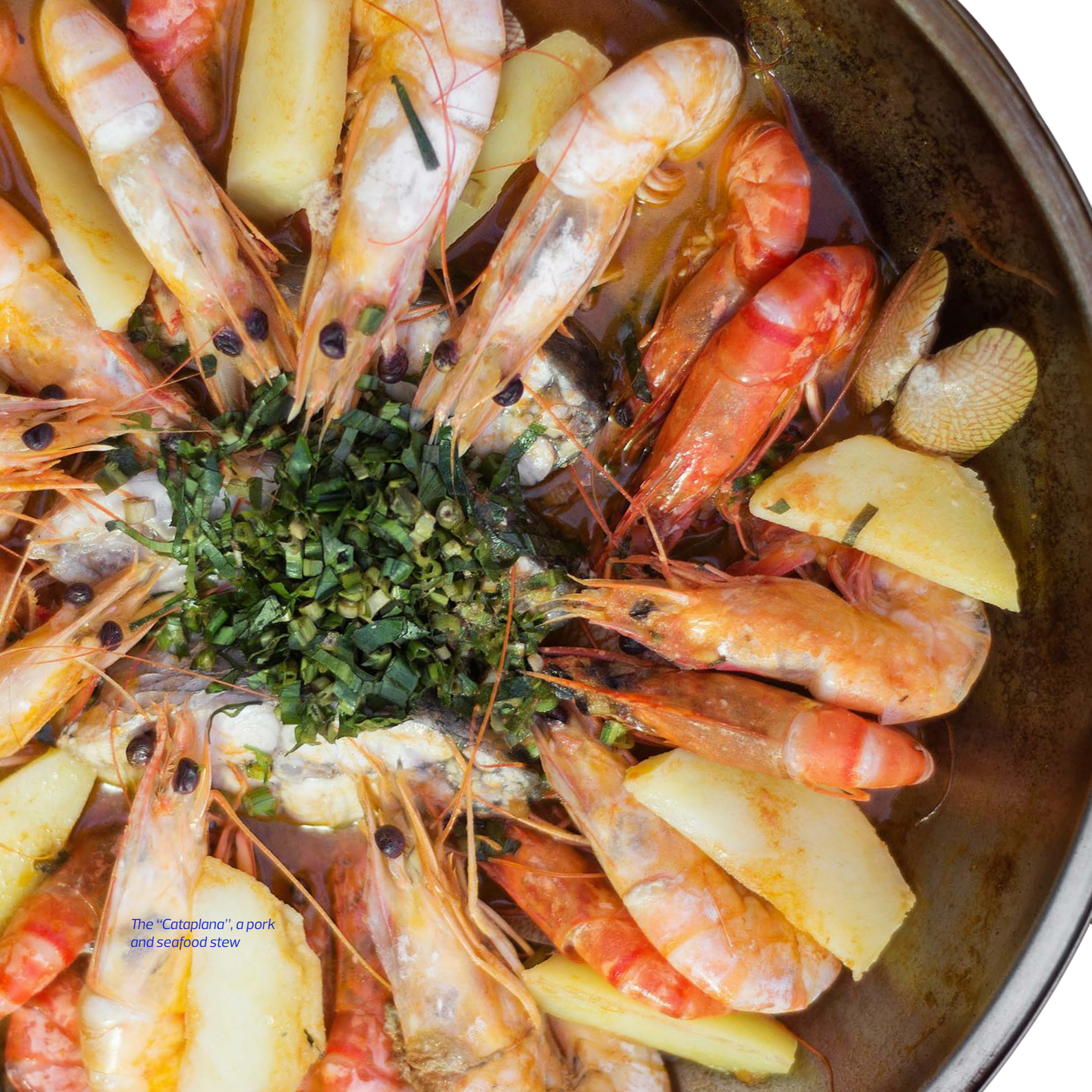
The "Cataplana", a pork and seafood stew