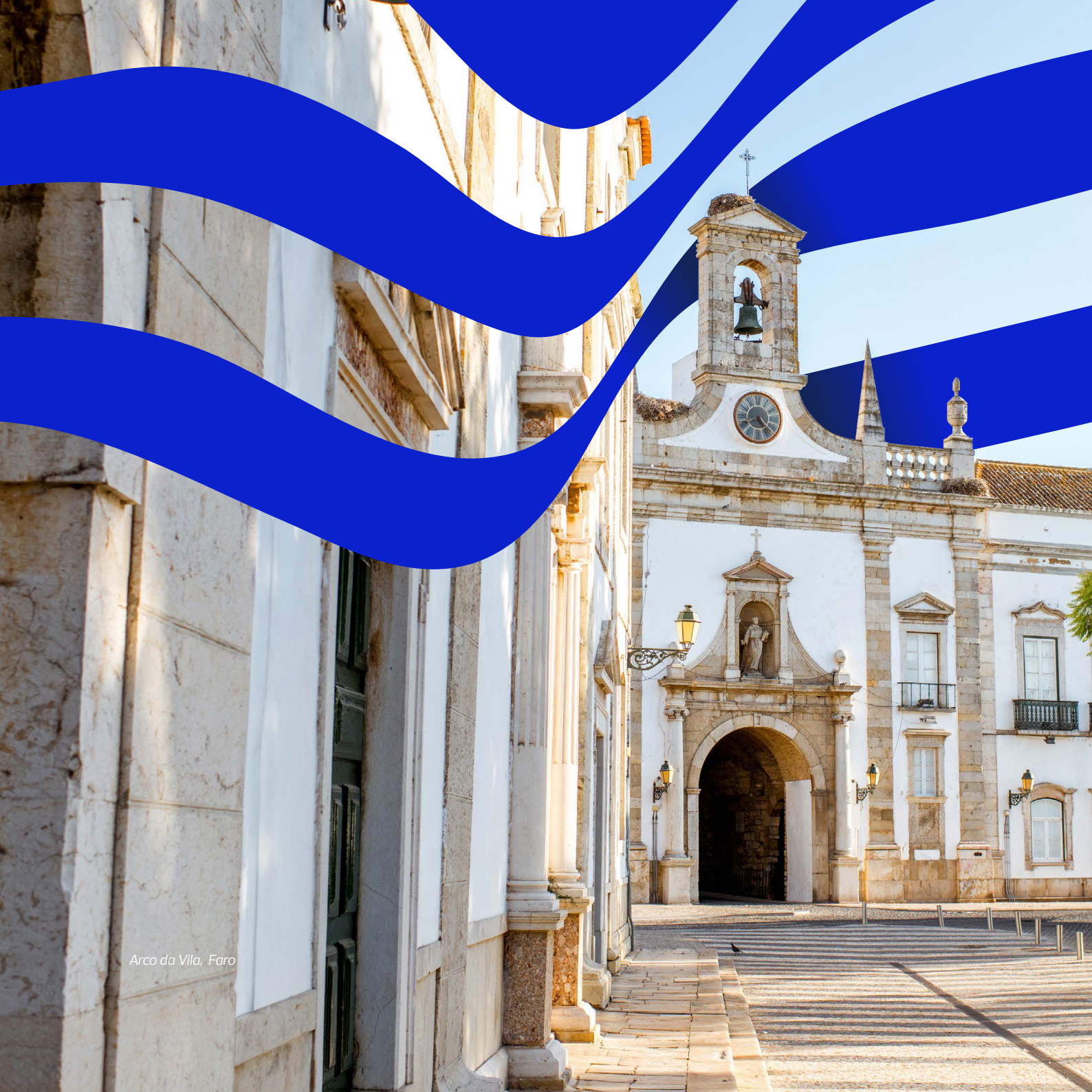
Arco da Vila, Faro